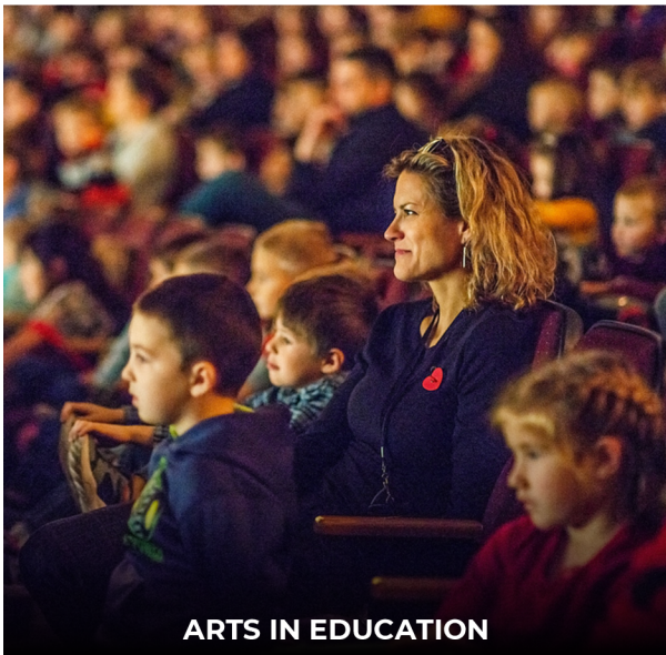
ARTS IN EDUCATION