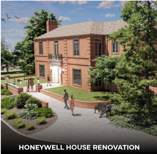
HONEYWELL HOUSE RENOVATION